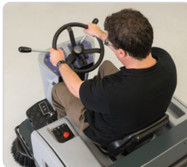
Clear-View™ enhances operator safety.