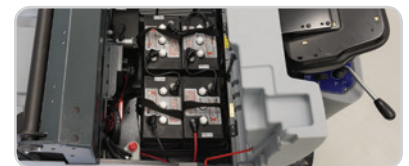
Tools-free broom and filter removal, and easy access to battery compartment makes routine maintenance and service fast and easy.