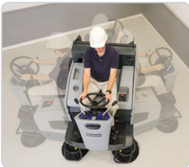
Front-wheel powered and steered drive wheel provides superior maneuverability, allowing operators to sweep in tight corners or narrow aisles.