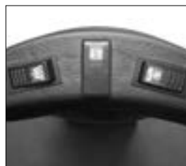
Brush control, direction control, and vacuum switches are located on the steering wheel.