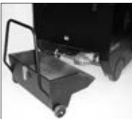
The 13.2-gal (50 liter) hopper can be easily removed and rolled to a dumpster.